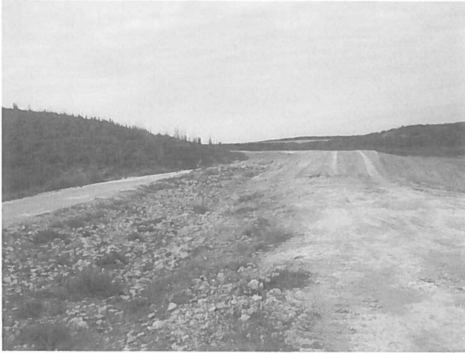
Photo 5: East end of contact water ditch for Landfill looking west