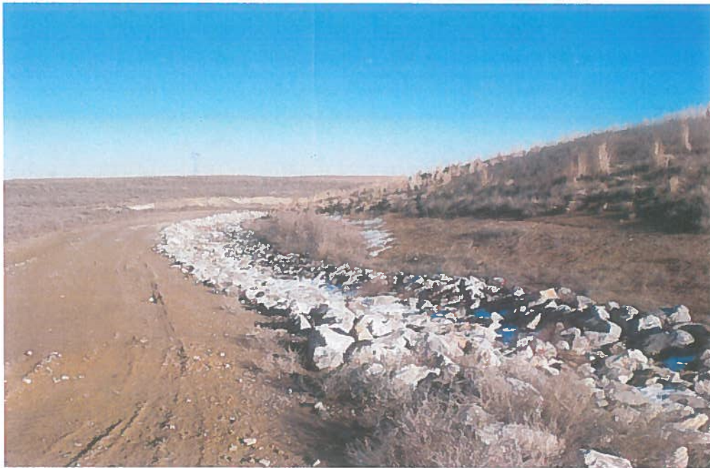
Photo 4: East side of Phase 3A looking east at contact water ditch