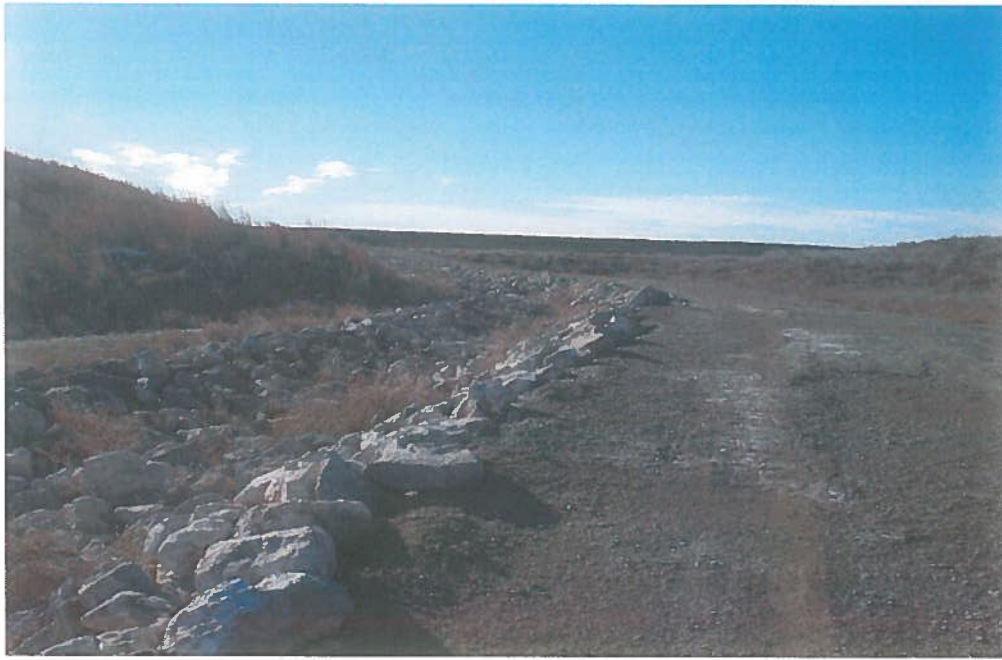
Photo 5: East end of contact water ditch for Landfill looking west